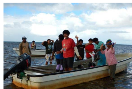
Fishers boarding the boat to go fishing.