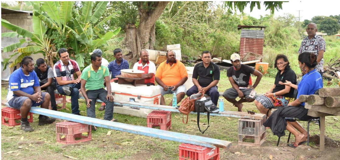
WCS staff presenting data on Indo-Fijian fishing communities in Tavua.

Non-indigenous (non- iTaukei ) groups make up just under half of Fiji's population, and many rely on coastal fisheries resources for their subsistence and livelihoods. There is very little information published on how non-iTaukei ethnic groups, the largest being Indo-Fijians (or Fijians of Indian descent), contribute to the coastal fisheries sector and the challenges they face as sellers or traders.