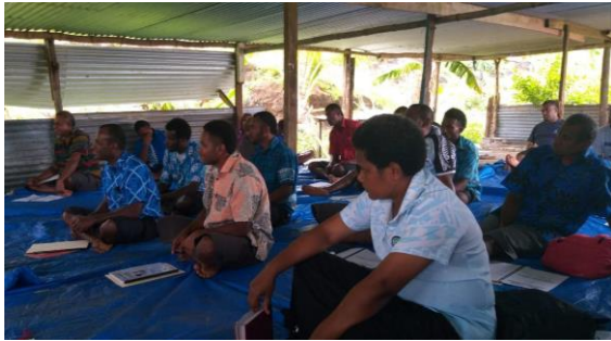
Participants of the fish warden training.

This year, the Vatu-i-Ra Conservation Park Management Committee opened a bank account to help manage and maintain their funds. A two-week Class 6 Boat Master training was conducted by Maritime Safety Authority of Fiji with support from WCS to train 10 people from Nakorotubu District in Ra. The graduates will be piloting the Vatu-i-Ra Conservation Park's monitoring and enforcement boat.