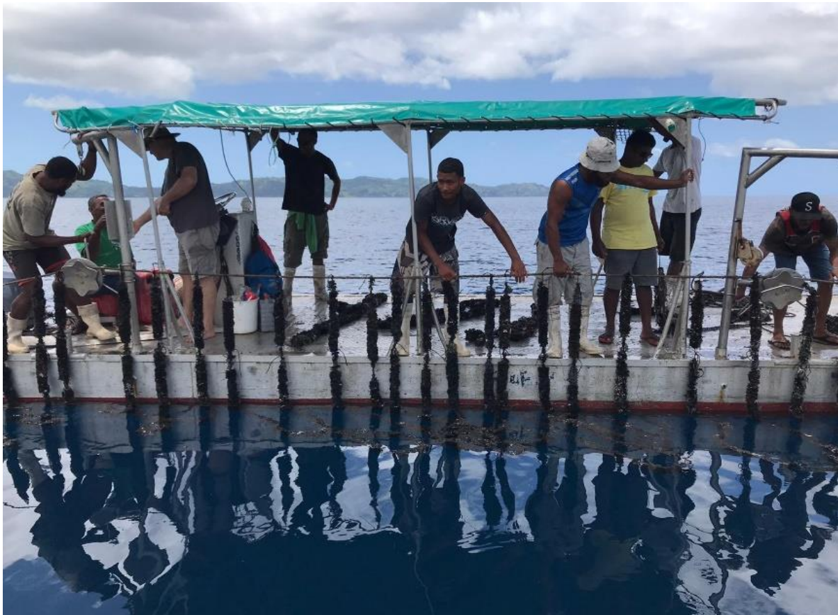
Installing the spat collectors onto the Va'ulele community farm.

Va'ulele Village in Wailevu District, Cakaudrove Province has established the first community pearl meat oyster farm in Fiji through a private sector-community partnership with J. Hunter Pearls Fiji (JHP) as the private sector partner, the Pacific Community (SPC) providing technical knowledge and WCS facilitating the development of the community. A series of workshops and trainings were carried out to build capacity of the villagers and pearl farm team. In August, WCS conducted a financial literacy and business planning training for the community to help understand the business and financial aspects of the project and the setting up of a Va'ulele pearl farm committee. The pearl oyster farm infrastructure was installed within the village iqoliqoli (traditional fishing rights area) in October and the first batch of 1,000 metres of spat collectors were deployed the following month.