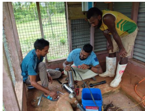
Repairing of the borehole pump at Tavulomo Village, Dama District, Bua Province.