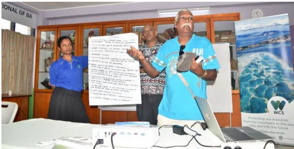
Indo-Fijian fisher of Ba providing comments at the workshop consultation for the Indo-Fijian fishing communities.

The completed report will provide guidance to the Ministry of Fisheries and partners on how to better support these important fisheries groups.