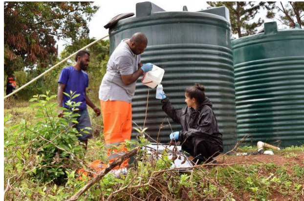
WISH Fiji field staff collecting water sample from the community tank.