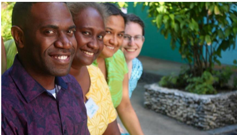
Facilitators of the gender training in Vanuatu.

The second edition of the “Handbook for Pacific Gender and Social Inclusion in Small-Scale Fisheries and Aquaculture” will be launched in March 2021. WCS worked closely with SPC to contribute, review and finalise four additional modules for the handbook: (1) community engagement (WCS co-authored the module with Drs. Aurelie Delisle and Danika Kleiber); (2) livelihood projects; (3) small-scale fisheries management; and (4) offshore fisheries. SPC and WCS co-hosted a workshop to get the feedback and inputs of other Pacific Island practitioners on the modules.