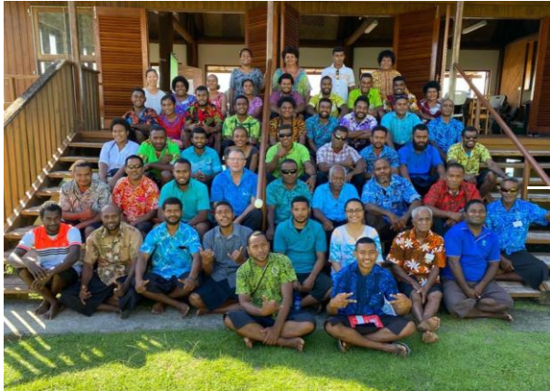
Participants of the pearl farm business planning workshop.

In December, a pearl biology and pearl farming techniques training was conducted by SPC. This project is expected to economically benefit more than 180 people from the village as the farm grows to supply the pearl meat to potential markets which JHP is working on developing. If found to be a viable livelihood project, the process will be fine-tuned to be replicated in other villages as it (i) improves economic livelihoods (ii) provides opportunities for employment and development, and (iii) supports non-extractive sustainable fisheries and protection of the environment.