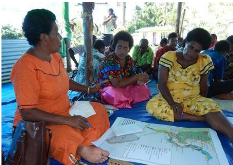
Community planning workshop

Community-based co-management is hailed as the solution to natural resource decline experienced by rural communities worldwide. It involves decentralised resource management which responds to social and conservation goals. The LMMA network in Fiji is one of the most extensive networks of community-based co-management sites in the world.