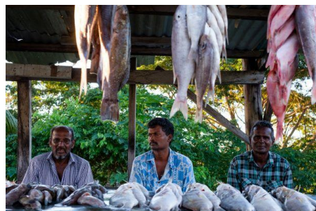
Indo-Fijian fishers selling fish by the roadside stall.

In May, WCS partnered with the Locally Managed Marine Area (LMMA) network to conduct surveys to document the impact of COVID-19 on the iTaukei coastal communities and the Indo-Fijian fishing communities. The studies were intended as a first step to inform other more extensive surveys (once national restrictions are lifted) or emergency responses. The data collected across ethnic groups, were examined through a gender lens. The results of this