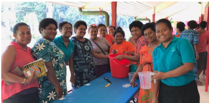
Participants of the Women in Fisheries training in Labasa with WCS staff getting ready for their practical session.

In November, women seafood vendors from the Labasa and Nabouwalu markets and communities including Tavulomo, Tiliva, Tavea and Kavewa villages of Bua Province were engaged in a three-day Women in Fisheries training conducted by WCS. The training was aimed at improving the capacity of women fishers to process, handle and sell seafood to domestic markets. It provided a platform for