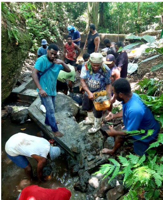
Villagers from Bureta District on Ovalau Island help build the dam.

Community engagement and field work resumed for WCS Fiji staff in mid-July after the Fiji Government eased COVID-19 restrictions on travel and gathering size. Staff presented back data from the baseline surveys to the 29 communities. The data highlighted risk factors that influence the prevalence or susceptibility of a community to water-related diseases. The data was used to assist in the development of the WSSPs and the WSSP process was used to assist communities in identifying other interventions to improve their water and sanitation infrastructure. Through this process, land management practices such as agriculture, forestry and livestock-keeping that require modification or improvement to further minimise and prevent disease risk to communities, and ensure ecosystems are healthy and productive will be identified.