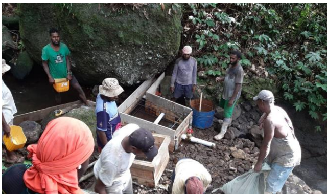
Villagers of Bureta District building the collection box with a sedimentation chamber at the dam site.

Two urgent interventions were carried out in 2020 with the first in the Bureta sub-catchment. A new dam with a collection box and a sedimentation chamber was built to help reduce sedimentation and improve the quality and supply of drinking water to the three villages of Naviteitei, Nasaga and Tai, a settlement, a health centre, a school and the Levuka airport. Two reservoirs in the Bureta sub-catchment were refurbished to improve access to water supply for over 400 people. In November, the villagers with support from the WISH Fiji project, Fiji's Mineral Resources Department, the Bua Provincial Administrator's Office, Bua Provincial Council Office and village-level Water and Sanitation Committee, repaired the broken solar pump for the Tavulomo Village in Dama District in Bua Province, restoring their primary source of water. In the aftermath of Tropical Cyclone Harold that passed through Fiji in April 2020, the Ministry announced an outbreak in the leptospirosis, typhoid and diarrhoea (LTD) cases in cyclone affected areas. To help curb the outbreak, WISH Fiji joined the fight against the LTDs by cleaning the St. Giles Hospital in Suva.