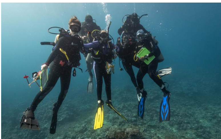
Marine scientists during the science expedition in September 2020.

Post cyclone surveys conducted in 2016 to assess and evaluate the impact of the cyclone and recovery potential of two coral reef systems found that the cyclone's 233 kilometres per hour winds and storm-surge induced waves damaged the two reef systems and communities that depend on them for food and livelihoods. In September 2020, a WCS led team of marine scientists surveyed the Namena Marine Reserve and Vatu-i-Ra Conservation Park to record any changes to the reefs since the 2016 Cyclone Winston.