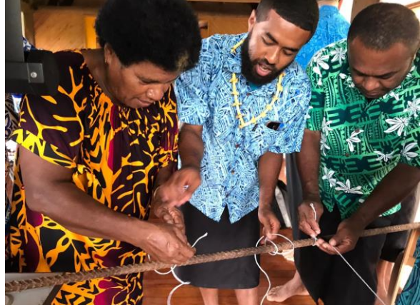
Learning how to tie the correct knots during the pearl farm technical workshop.